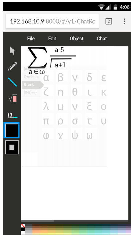
Figure 3: MC^2 Mathematical Editor screen with translucent symbol keyboard displayed.